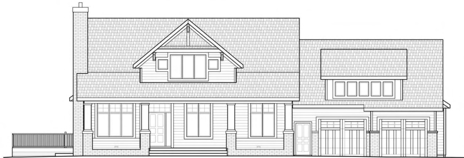
FRONT ELEVATION SCALE 3/32" = 1'-0"