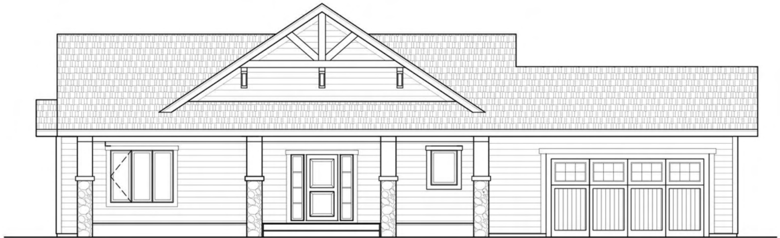
FRONT ELEVATION SCALE 1/8" = 1'-0"